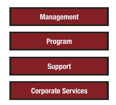
Figure 1: Activity Classifications – Sustaining Agenda

There is another often overlooked set of activities, an organization's innovation or change management activities that are designed to transform the business, derived from a set of strategic initiatives that represent its "change agenda". Such initiatives have a specific timeline associated with their implementation and once fully implemented, they become part of an organization's sustaining agenda to be replaced by a new series of projects directed at changing the business. Examples of innovation initiatives are the implementation of performance measurement or risk management; they can be program related as well.